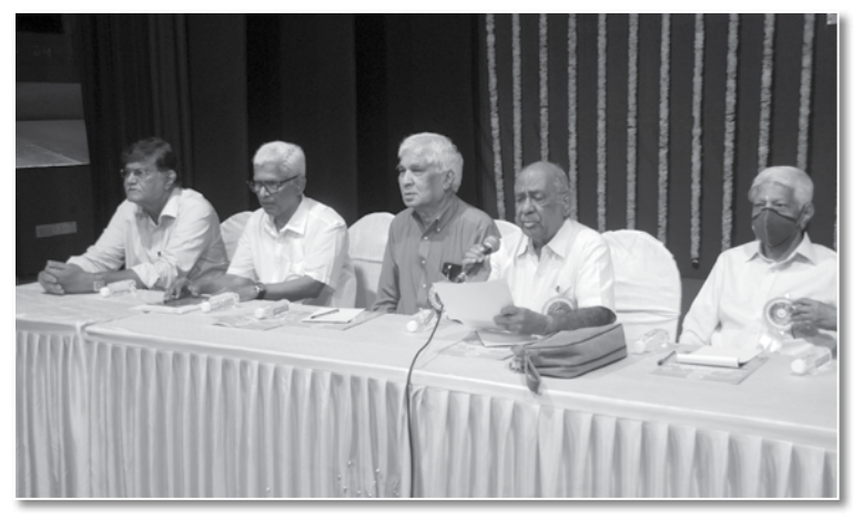
Office Bearers on Dias in A.G.M. Of 27 March 2022

He then thanked him for carving out valuable time from his busy schedule to attend, this meeting.