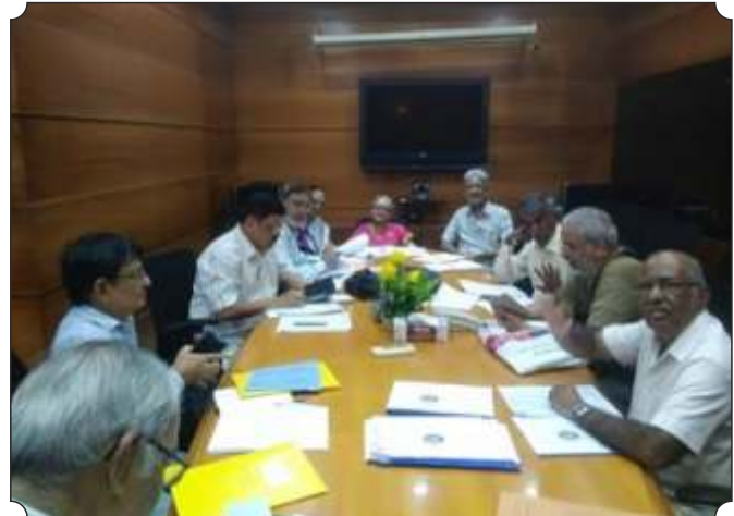
This picture of Executive Committee Meeting at Conference Room, Andheri Large Corporate Branch, Andheri, Mumbai

During the year 1st April 2023 to 31st March 2024, total six meetings of the Executive Committee of our association were held on 09.06.2023, 04.07.2023, 12.10.2023, 08.01.2024, 06.02.2024 and 23.03.2024. The attendance of various members for the meetings was as under: -